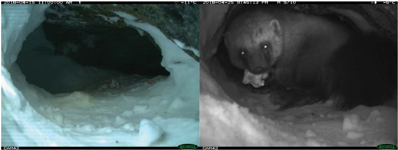
FIG. 3. Wolverine resting burrow created under an overhanging cliff.

At three dens, each used by a different wolverine, we observed a wolverine emerge from or enter the den while we were placing cameras. In all three instances, the female removed her kits from the den within a day and did not return (one of these was the 330 m movement described above). In a separate instance, the first photograph from the camera (13 hours after placement) was of the female wolverine emerging from the den, which suggests that she was inside the den at the time of camera placement. She and three kits continued to use the den until snow deteriorated 22 days later.