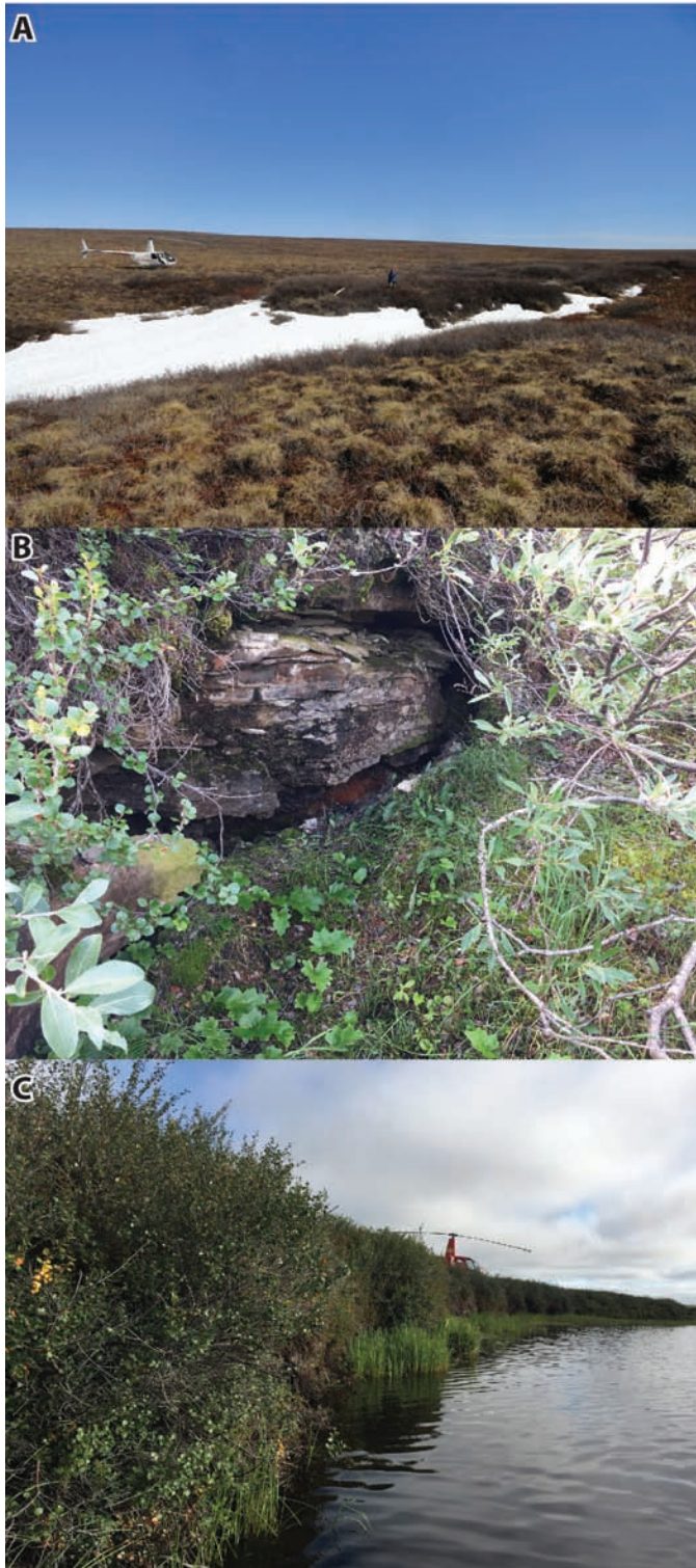
FIG. 4. Examples of snowdrift-forming structures associated with wolverine reproductive dens: intermittent stream (A), 1 m tall partially buried boulder (B), and cutbank on lake edge (C).

for consumption. We found no food remains at 15 burrows (Table 4), suggesting that resting is often the primary